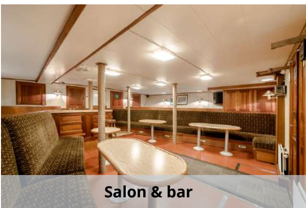
Salon & bar

All rooms are comfortable but basic and with shared bathroom. There are four twin rooms available with upcost